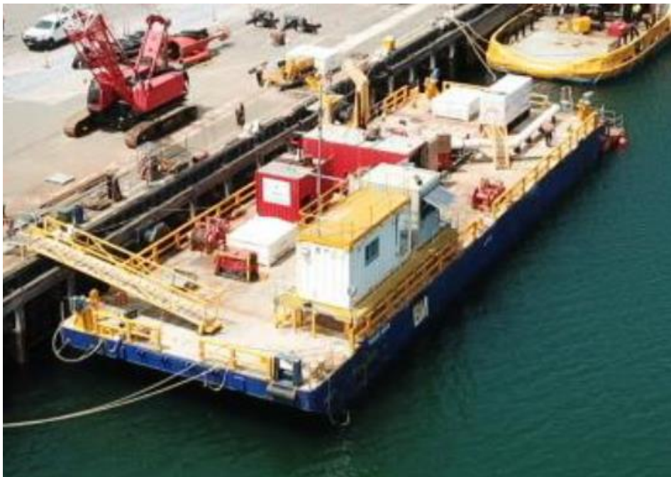
Picture 1 Barge Vincent