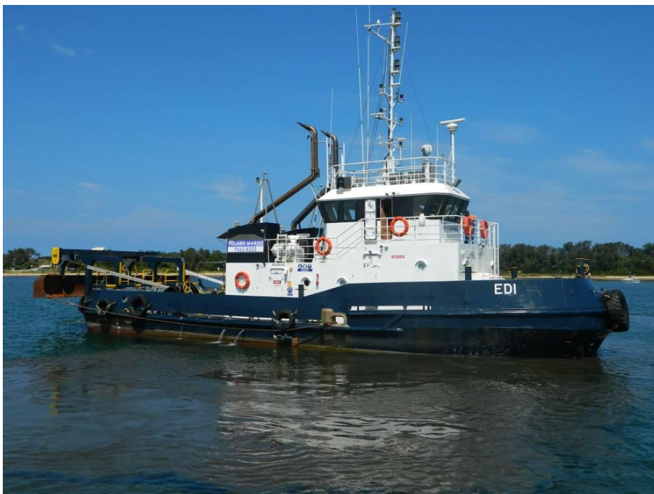
Picture 2 Tug Edi